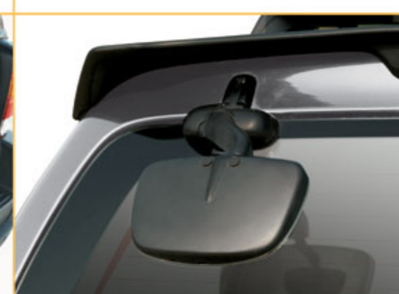
Rear Mirror CB-FE-06

Manufacture from ELASTOMER rubber. Reduce the slippery of the luggage. with the extended edge trim for protect the fluid to the car carpet. And available to take out for clean. No Drilling