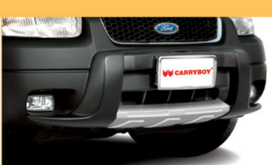
Front Bumper Over Rider CB-FE-01

Manufacture from high quality polyurethane with the skid plate looked in silver color painted. No distributed effective to the SRS (AIRBACK System) and No Drilling .