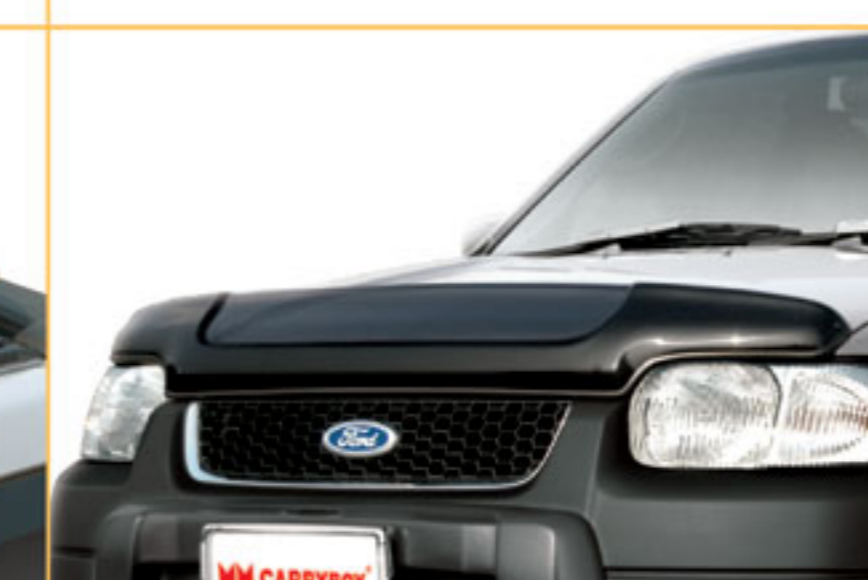
Hood Deflector CB-FE-08

Increase your volumn luggage by complete roof rack set. Design unique for ESCAPE with the total height only 189 cm. to avoid the inside building parking road height. And its aerodynamic design. Manufacture from high quality Aluminum with Black powder coat. Available to install on the original side rail without any drilling. Free luggage cargo net No Drilling