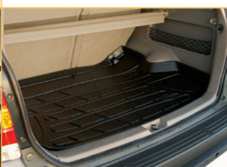
Luggage Tray CB-FE-11

Protect you hood and reduce the bug while drive. Manufacture from the best quality acrylic plastic. Strong, durable, beautiful with the latest design. No Drilling