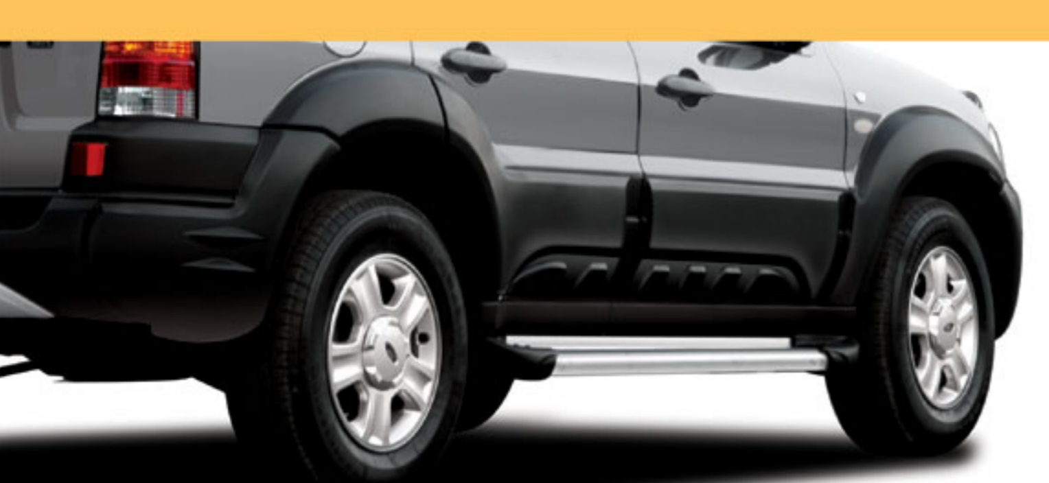
Over Fender-Rock Guard CB-FE-03

Manufacture from high quality polyurethane with the skid plate looked in silver color painted. No distributed effective to the SRS (AIRBACK System) and No Drilling .