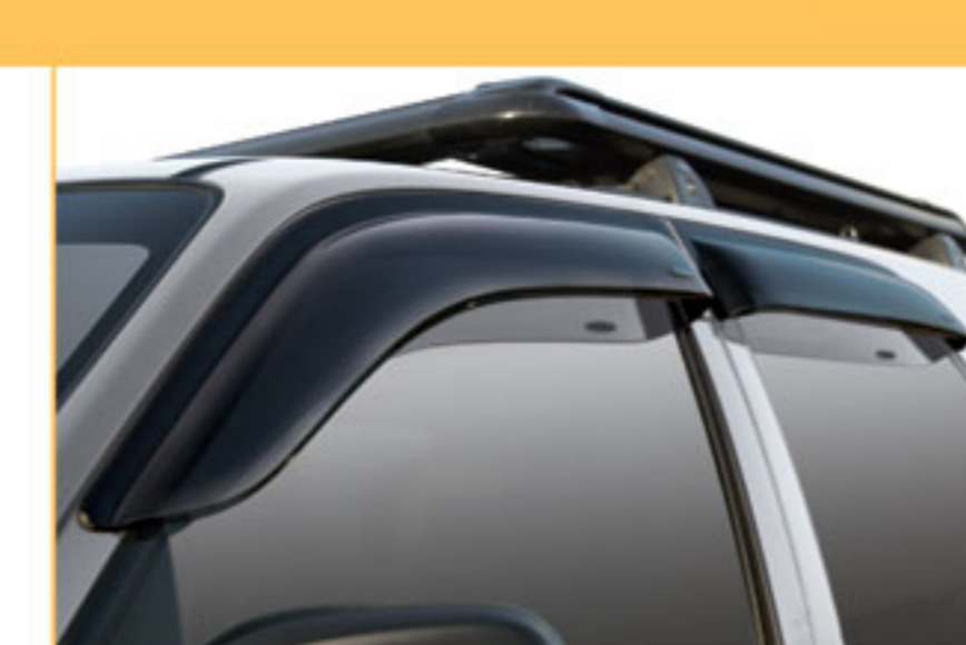
Door Visor CB-FE-09

Created your unique design on you SUV. All the parts from the Front - Side and Rear are unique design for ESCAPE Manufacture from high quality ABS plastic and No Drilling .