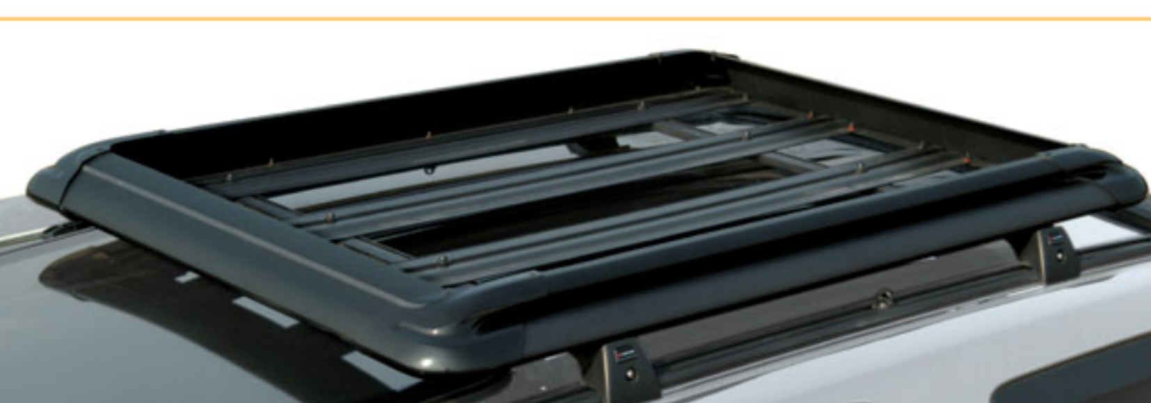
Roof Rack Set CB-FE-10

Fully Guard Protection with the skid plate design looked in silver color painted. Contour designed with the fender flare and body cladding in UNIQUE. No Drilling