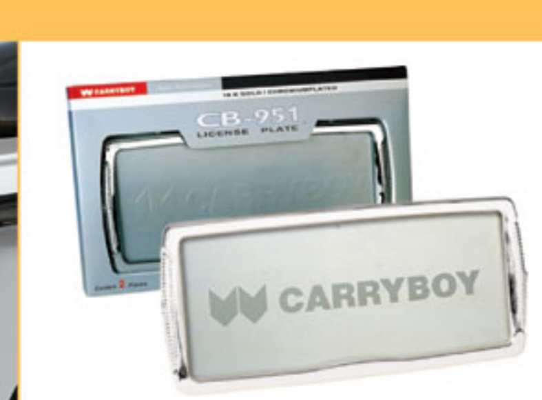
License Plate Frame CB-951

Designed with Aerodynamic concept. Extend the stabilizing on high-speed drive. Innovative style and outstanding looks with shiny stainless. No Drilling