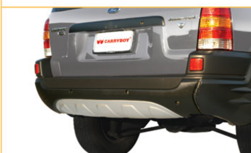
Rear Bumper Cover CB-FE-02

Fully Guard Protection with the skid plate design looked in silver color painted. Contour designed with the fender flare and body cladding in UNIQUE. No Drilling