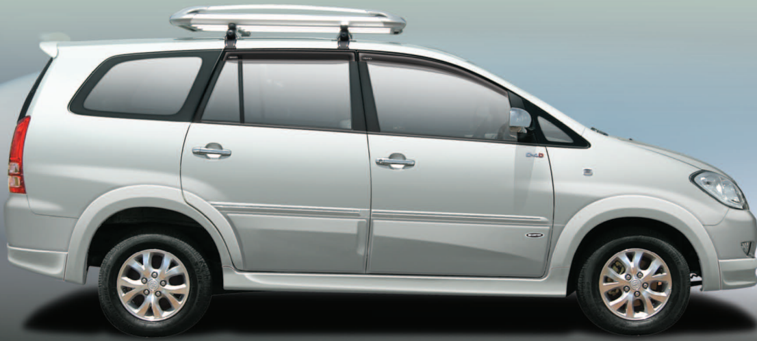
CB-TI-03 Side Lower Skirt Aeropart unique design for INNOVA . Produced from high grade ABS plastic