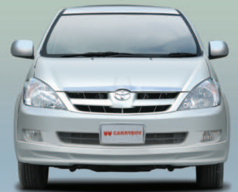
CB-TI-01 Front Lower Skirt