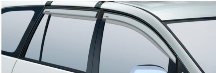
CB-701TI-A65 Door Visor (Clear & Screen Design) Contour design & useful for air ventilation in bad weather & rain