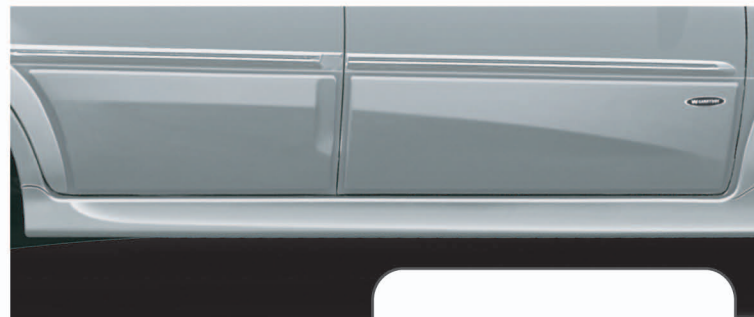
CB-TI-05 Body Cladding Useful for protect from the stone when drive.

* The designs have been patented with the intellectual Property Department