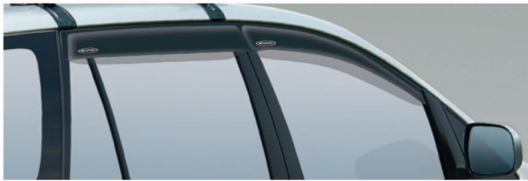
CB-701-TI Door Visor (Tinted)