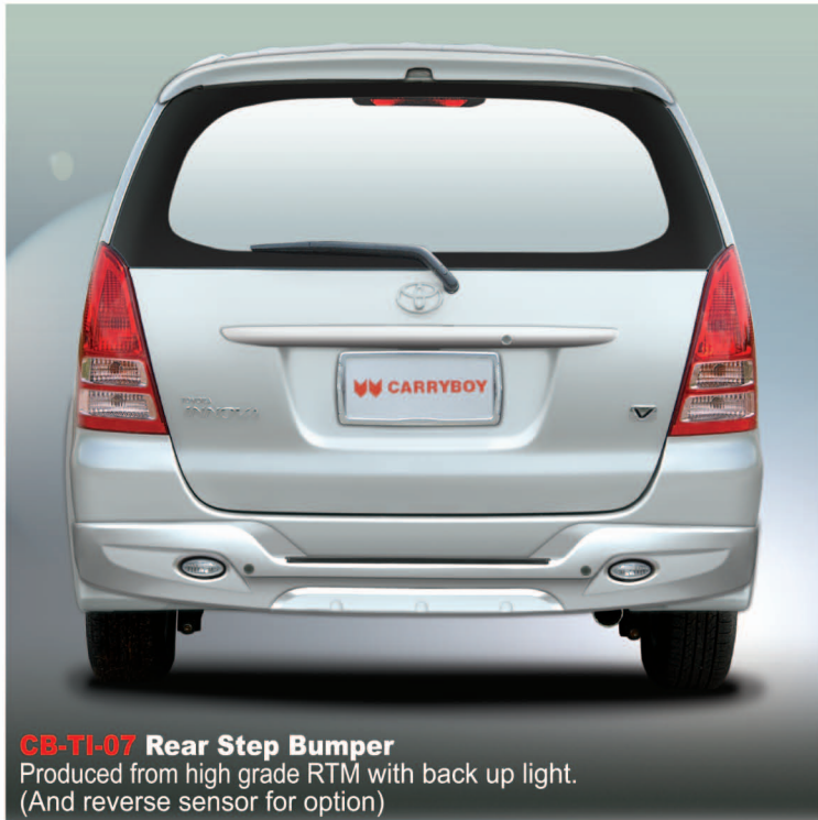
CB-TI-07 Rear Step Bumper Produced from high grade RTM with back up light. (And reverse sensor for option)