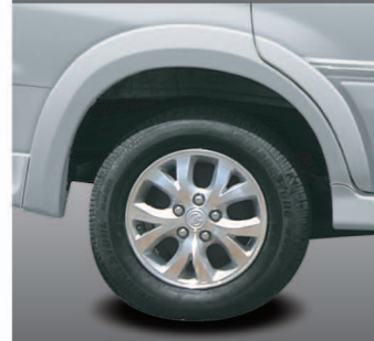
CB-TI-04 Fender Flare Produced from high grade ABS plastic, contour design