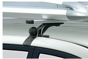
CB-552-TI Cross Roof Rack Produced from high grade aluminum. Innovative design, no water leak