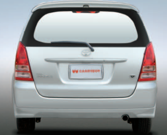
CB-TI-02 Rear Lower Skirt