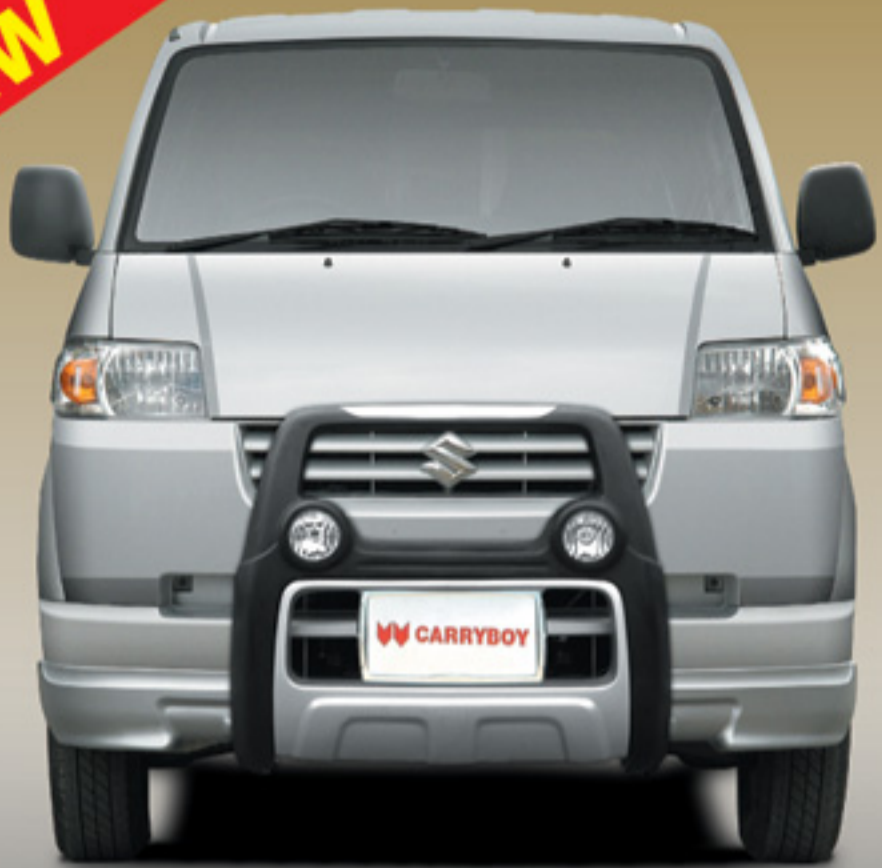
CB-730-SA Front Nudge Guard with Fog lamp Produced from high quality polyurethane with center skid plate (RTM). (Harness, Switch, Relay: additional components).