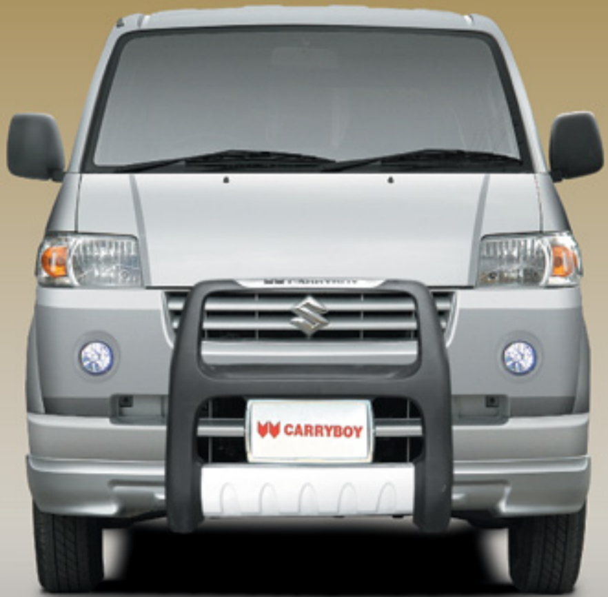
CB-705-SA Front Nudge Guard Polyurethane Produced from high quality polyurethane with center aluminum skid plate.