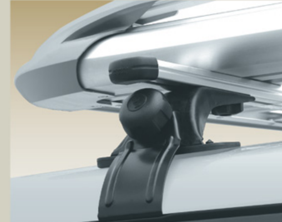
CB-552-SA Cross Roof Rack Produced from high grade aluminum. Innovative design, no water leak