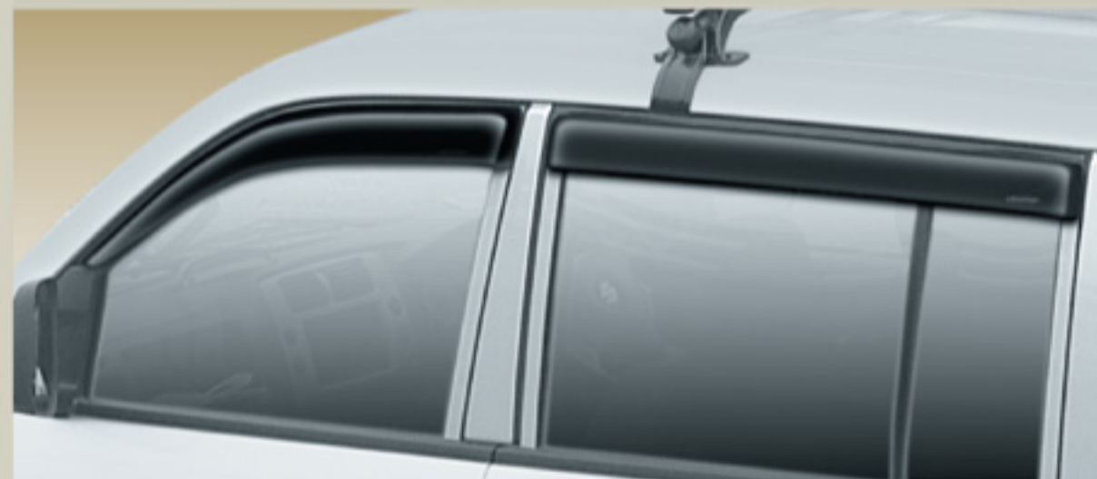
CE-701-SA Door Visor Contour design & useful for air ventilation in bad weather & rain