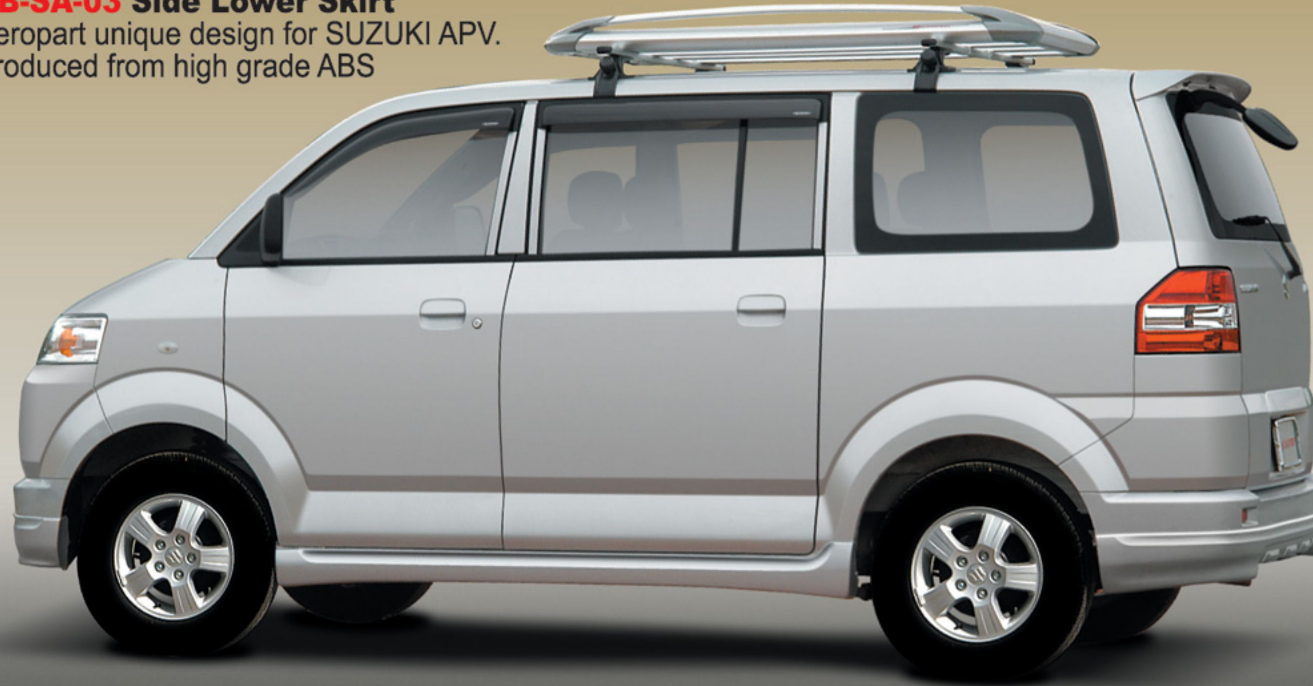
CB-SA-03 Side Lower Skirt Aeropart unique design for SUZUKI APV. Produced from high grade ABS