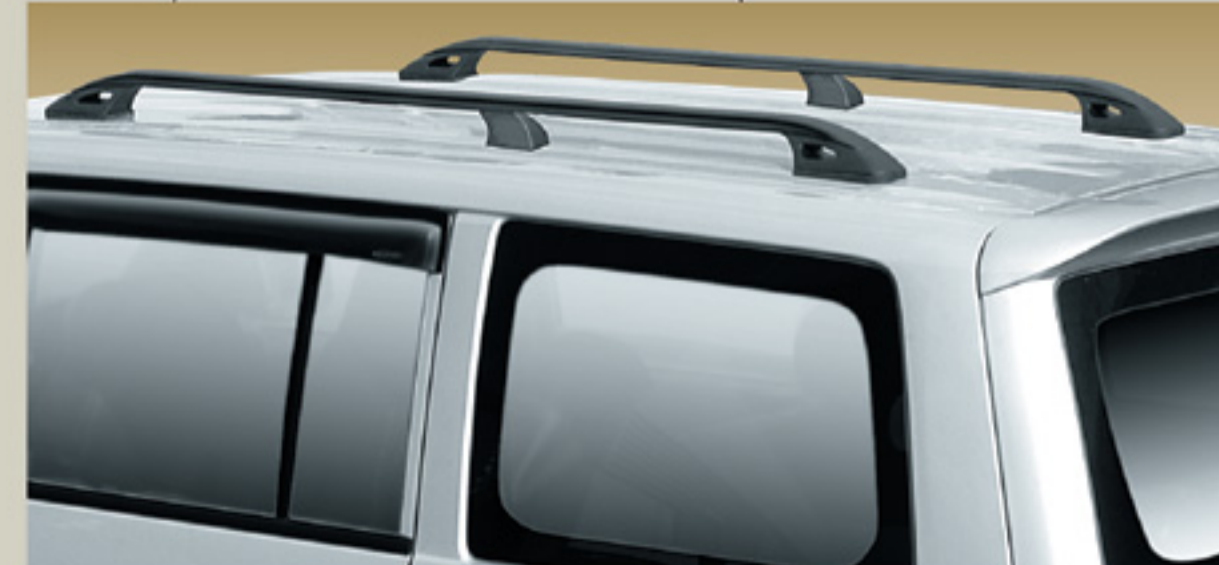
CE-822B-12 Roof Rack Produced from aluminum of OEM quality, with zinc injection stands in black powder coat painted.