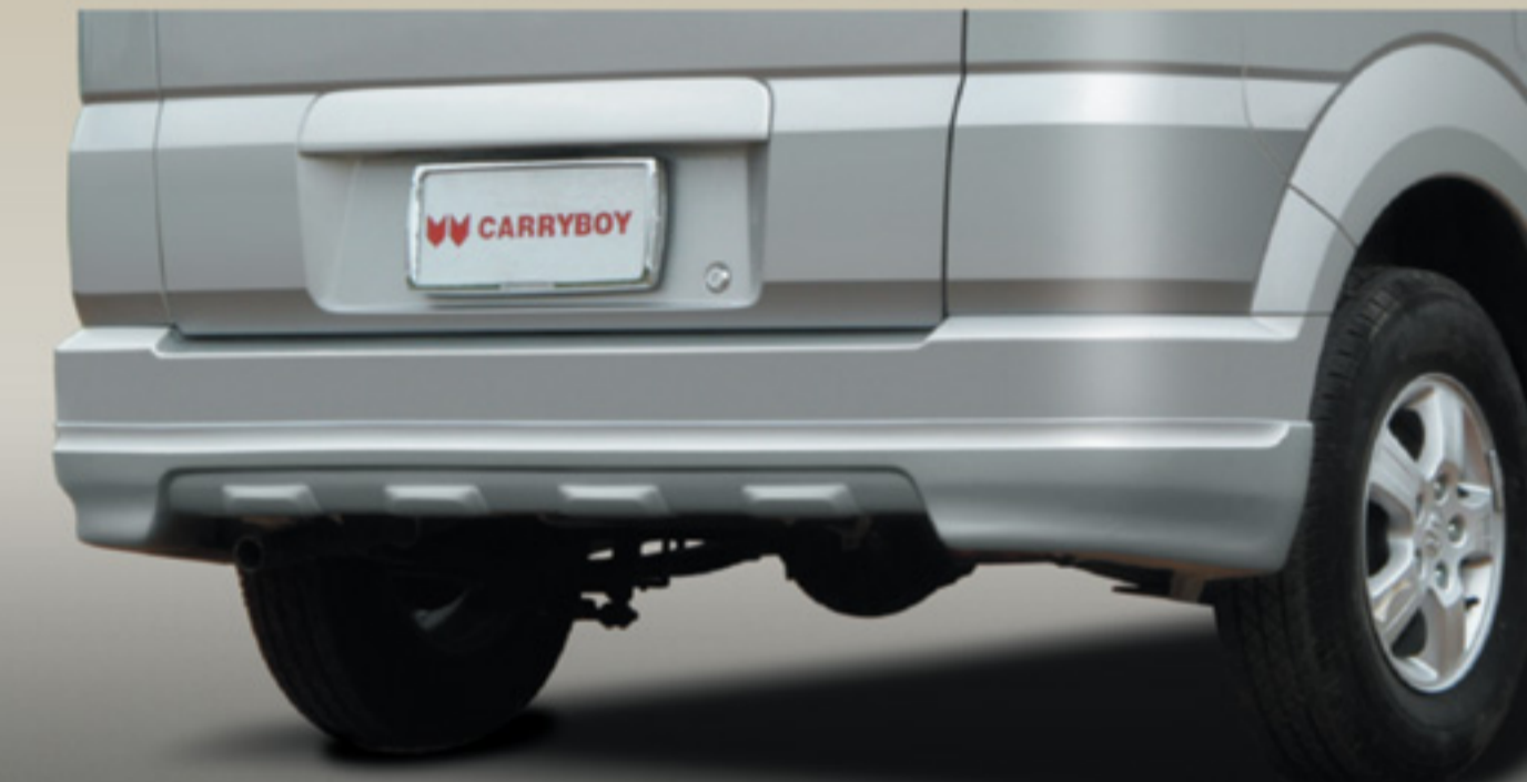
CB-SA-02 Rear Lower Skirt