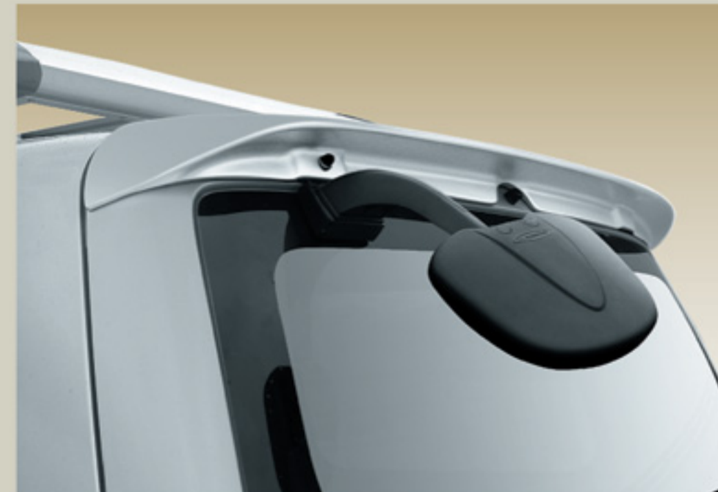
CB-SA-04 Rear Spoiler Produced from high grade RTM with contour design. CB-553-SA Reverse Mirror Better back up vision.