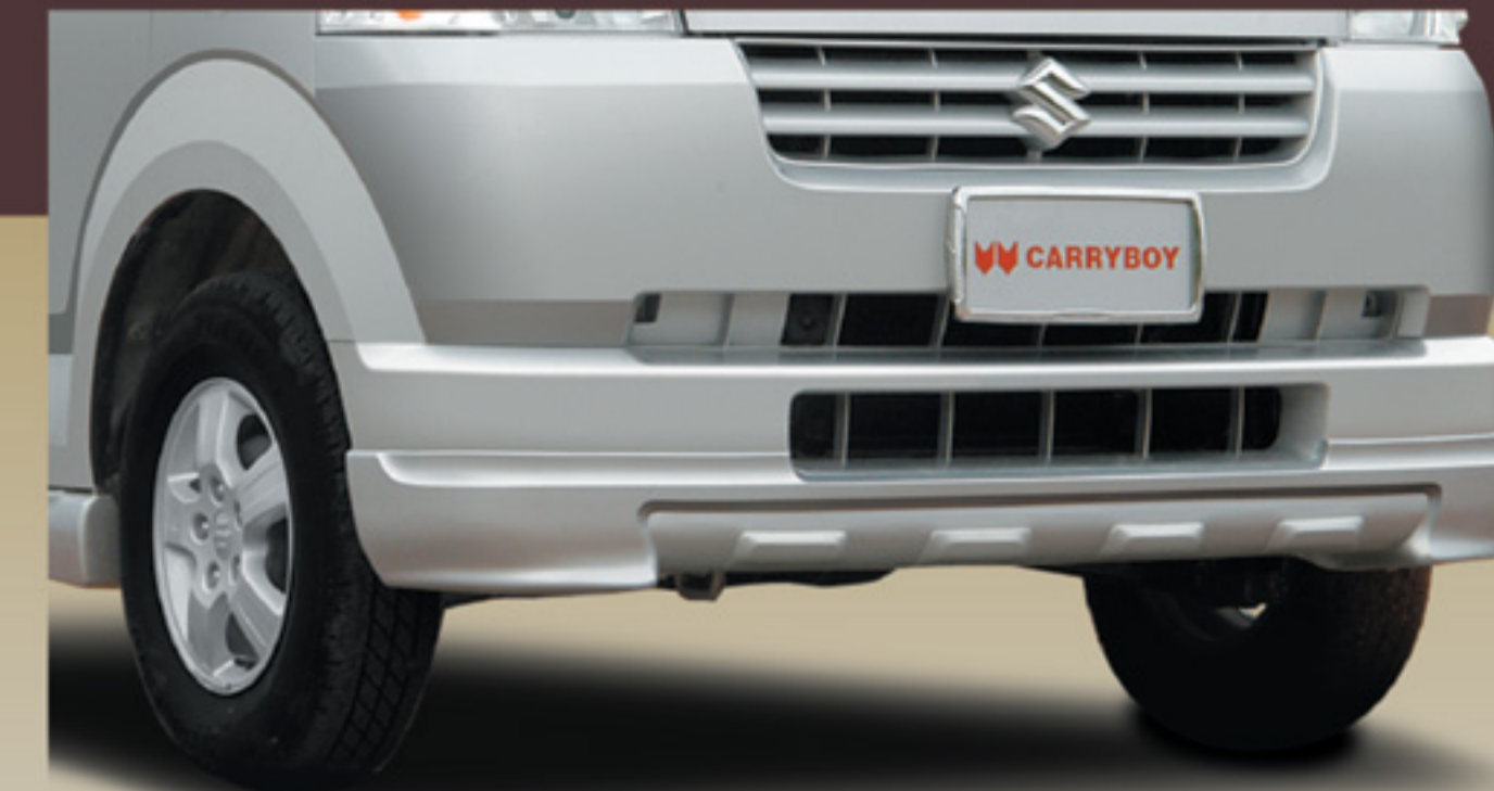
CB-SA-01 Front Lower Skirt