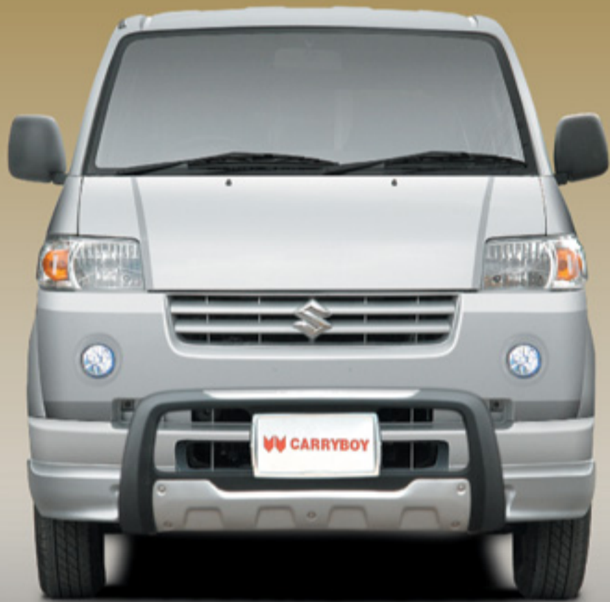
CB-721-SA Front Bumper Guard Cover Produced from polyurethane, high quality material with aluminum skid plate.